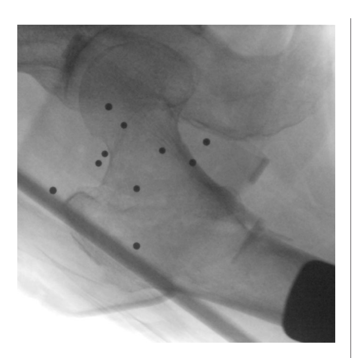
Fig. 2 Anteroposterior image of the hip joint, with all 10 location points on the positioning ruler in it.

(Fig. 5), a horizontal 3-4-cm incision was made at the proximal point of the skin pin. After reaming the proximal pulp, the main screw was inserted, and the lag screw, the distal locking screw, and the nail cap were successively installed. Sutured the patient's operative incisions.