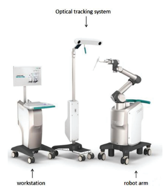
Fig. 1 TiRobot, mainly composed of a workstation, an optical tracking system, and a robot arm (Photo provided by Beijing Tianzhihang Medical Technology).

The operation was performed with the help of TiRobot. The orthopaedic surgical robot was prepositioned. The surgical area was routinely disinfected and covered with surgical towels. The positioning ruler and the robot arm were