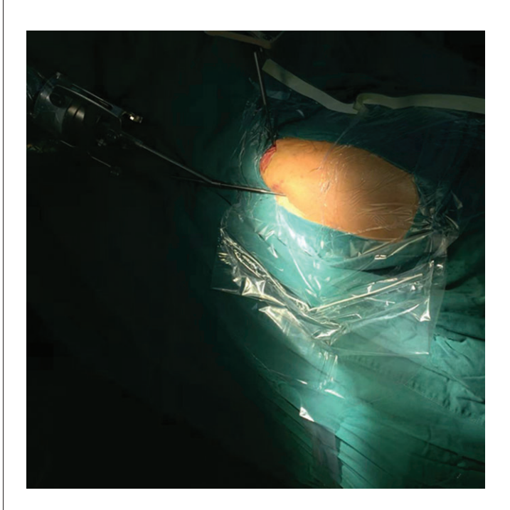
Fig. 4 Photograph of the operative region of a patient's hip. A guide pin was drilled into the femoral medullary cavity percutaneously assisted by the robot arm.